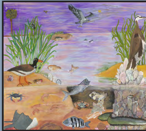
Middle school art clubs have created living murals at environmental education centers

The South Carolina Oyster Restoration and Enhancement Program allows community volunteers to work with scientists to restore and monitor oyster habitat along the South Carolina coast. Volunteers recycle and bag oyster shell, construct oyster reefs, collect spat, and monitor water quality and reef progress. SCORE volunteers have used more than 570 tons of shell to build 190 reefs at 37 sites since 2001. These sites are used as research platforms to improve restoration success.