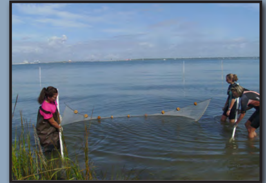
Volunteers sample around oyster reefs