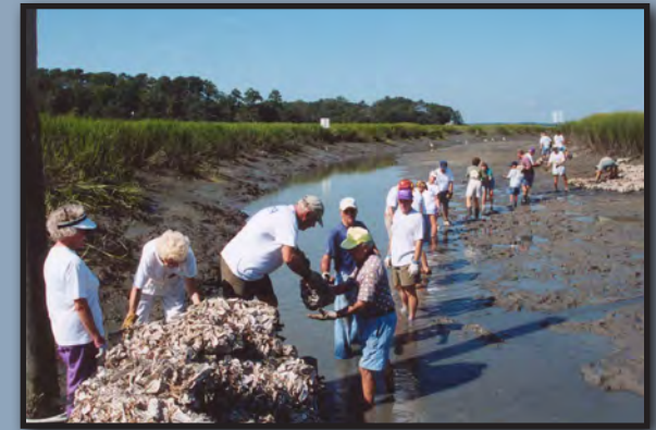
Volunteers form a human chain to pass the shell bags to the shoreline