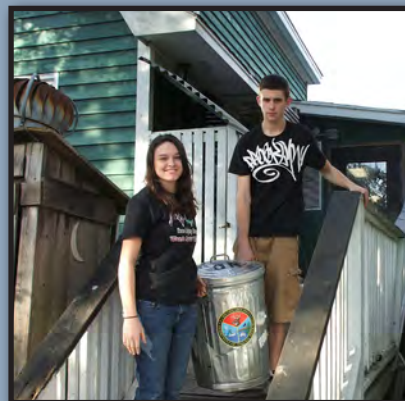
Volunteers recycle shell at designated restaurants to help increase our supply