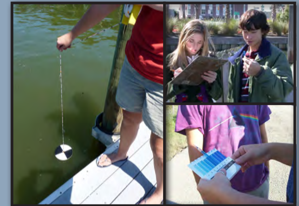
Volunteers monitor water quality weekly at restoration sites and enter data online at our interactive website http://score.dnr.sc.gov